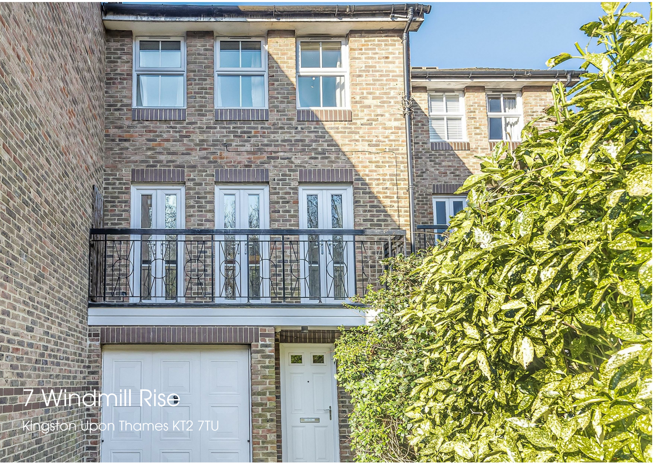
7 Windmill Rise Kingston upon Thames KT2 7TU